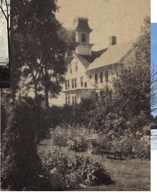
1921 (Big addition)