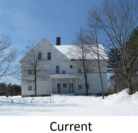
Current Configuration (post 1958)